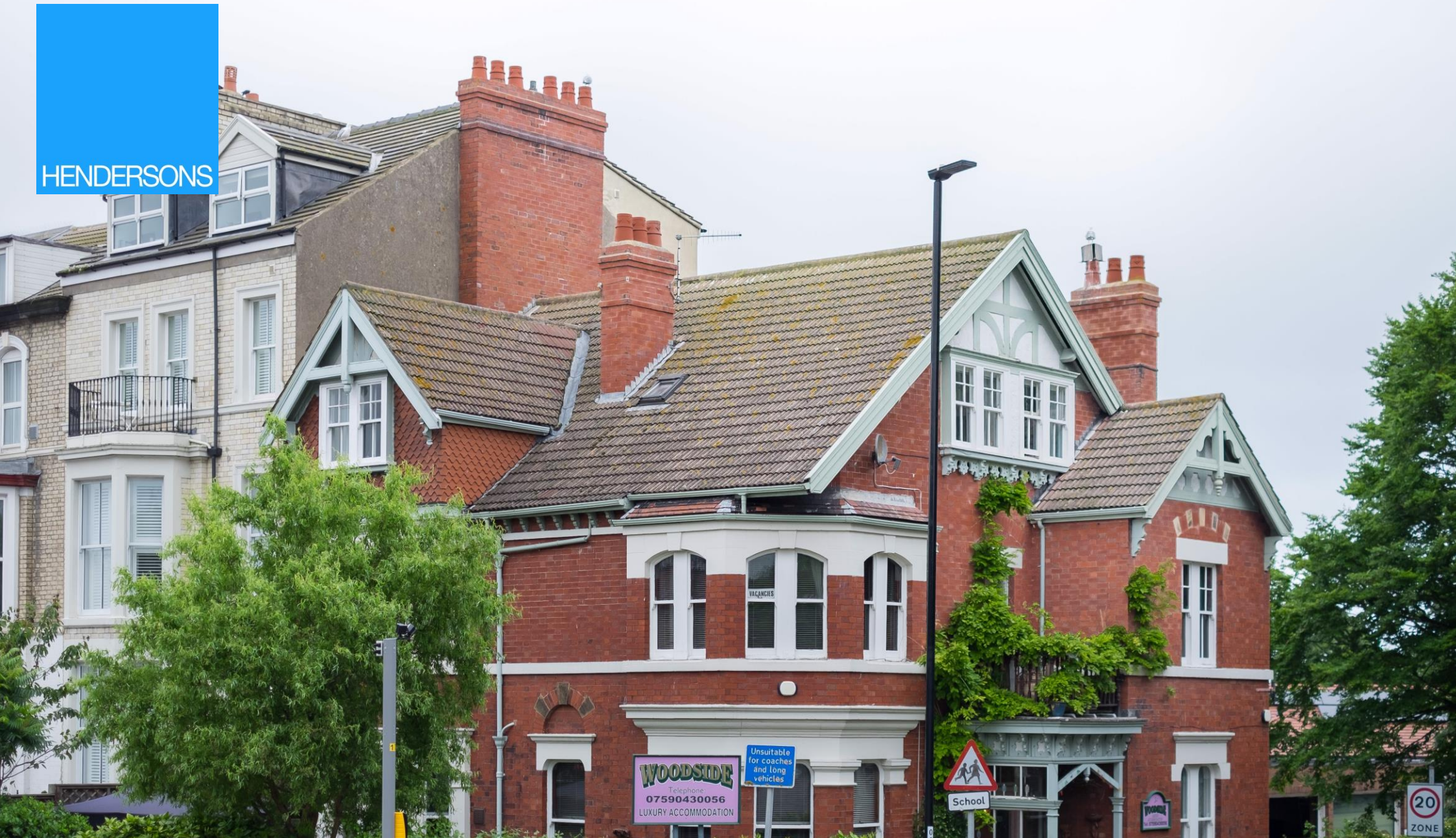
WOODSIDE VILLA, 16 PROSPECT HILL, WHITBY Guide Price £650,000